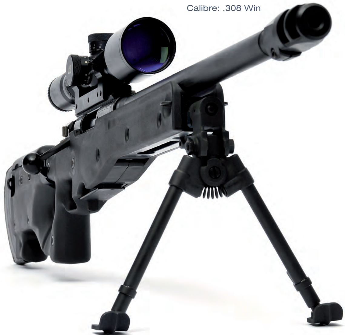
Calibre: .308 Win