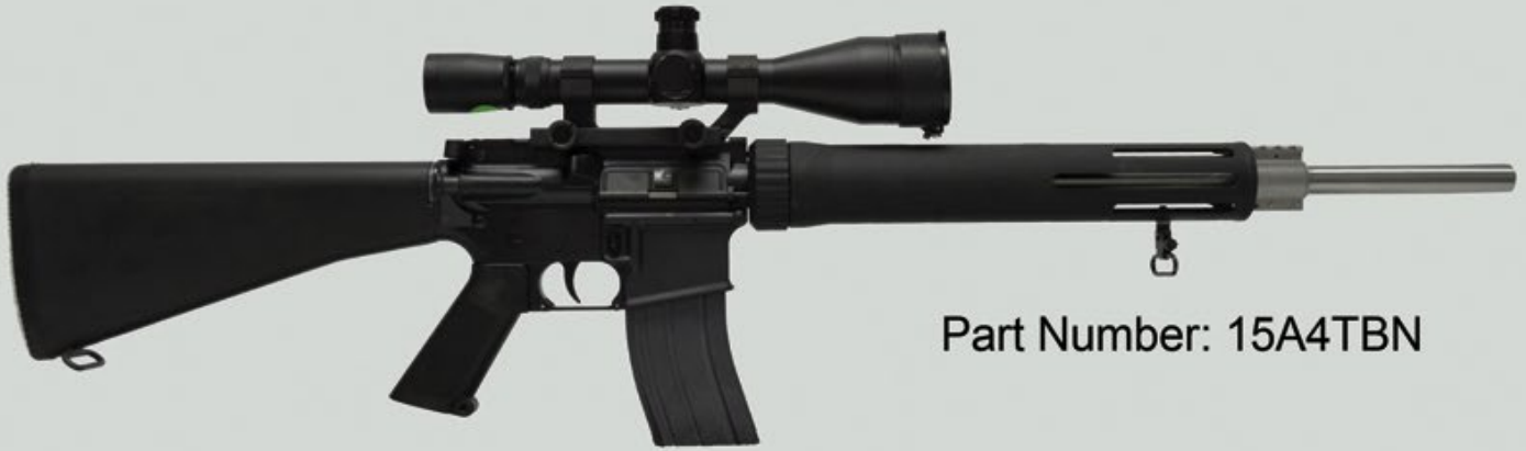
Part Number: 15A4TBN