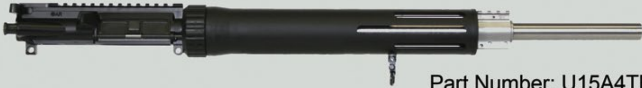
Part Number: U15A4TB