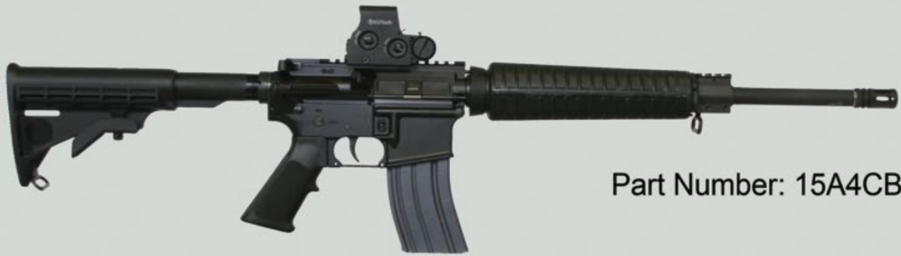
Part Number: 15A4CB