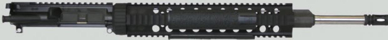
Part Number: U15TB