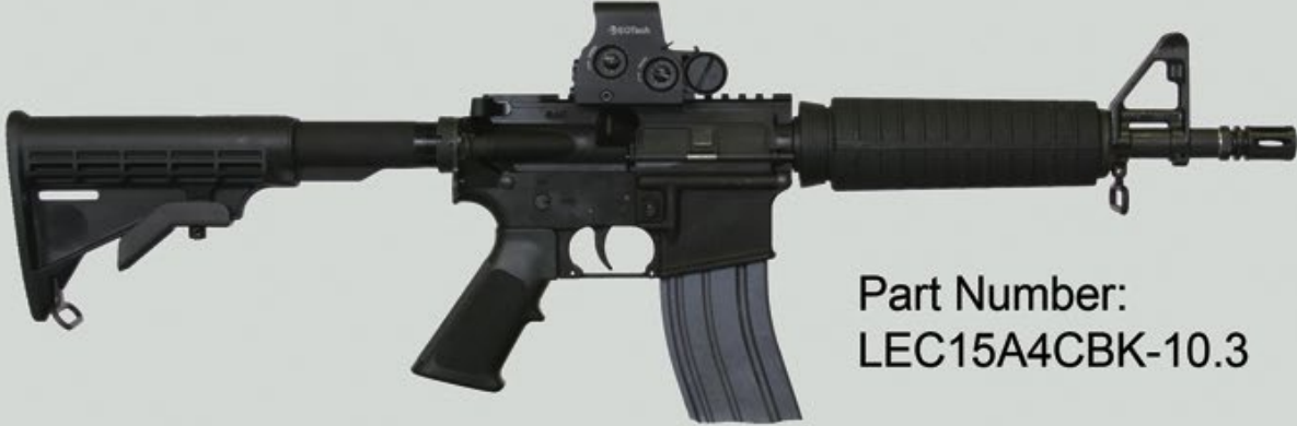
Part Number: LEC15A4CBK-10.3