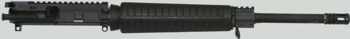
Part Number: U15A4CB