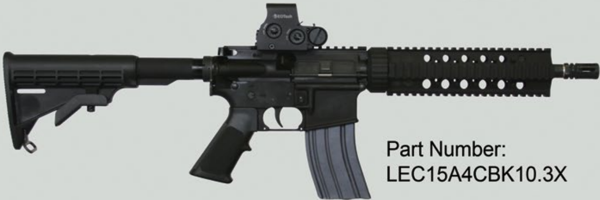
Part Number: LEC15A4CBK10.3X