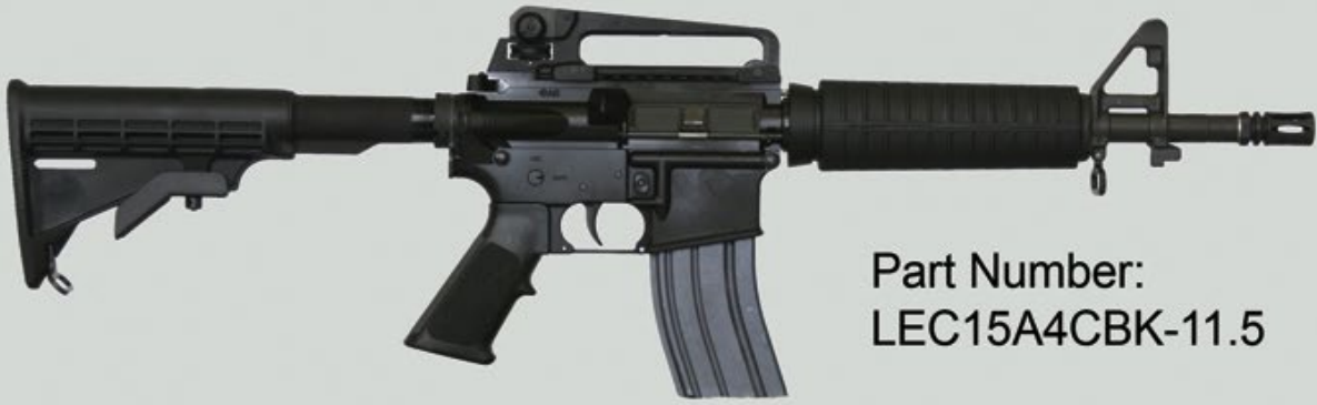
Part Number: LEC15A4CBK-11.5