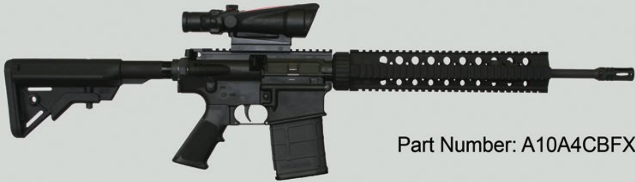
Part Number: A10A4CBFX