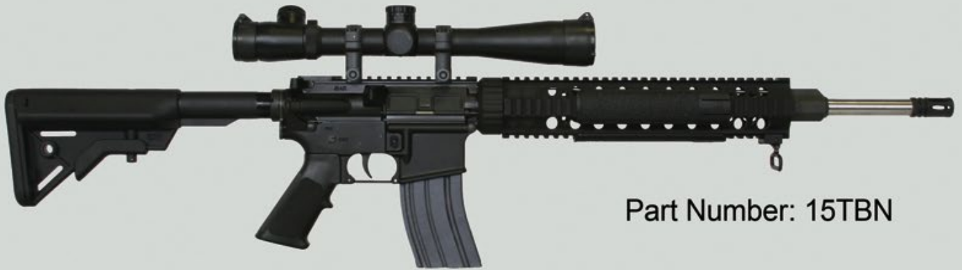
Part Number: 15TBN