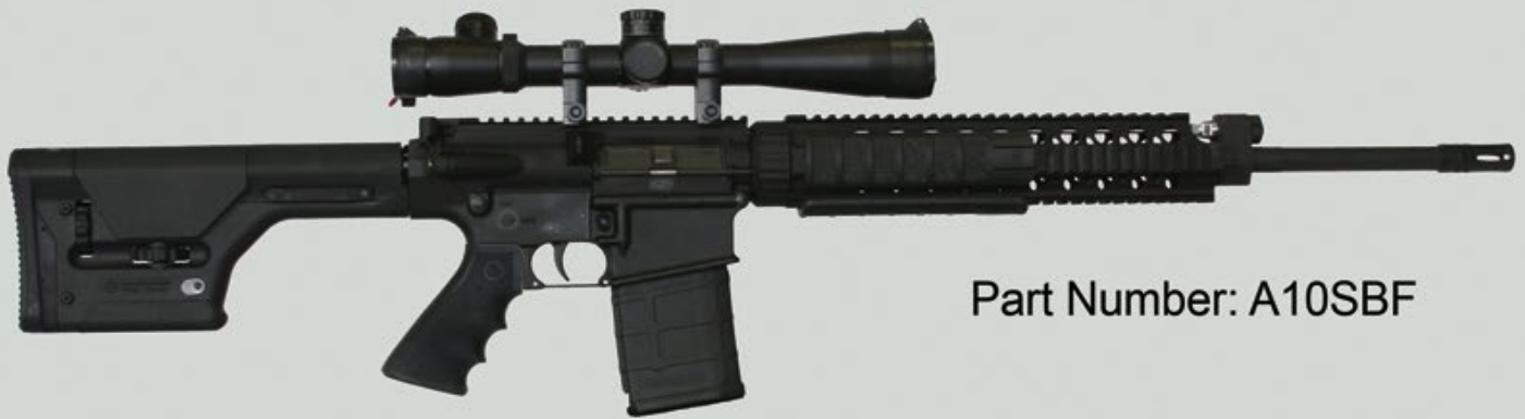
Part Number: A10SBF