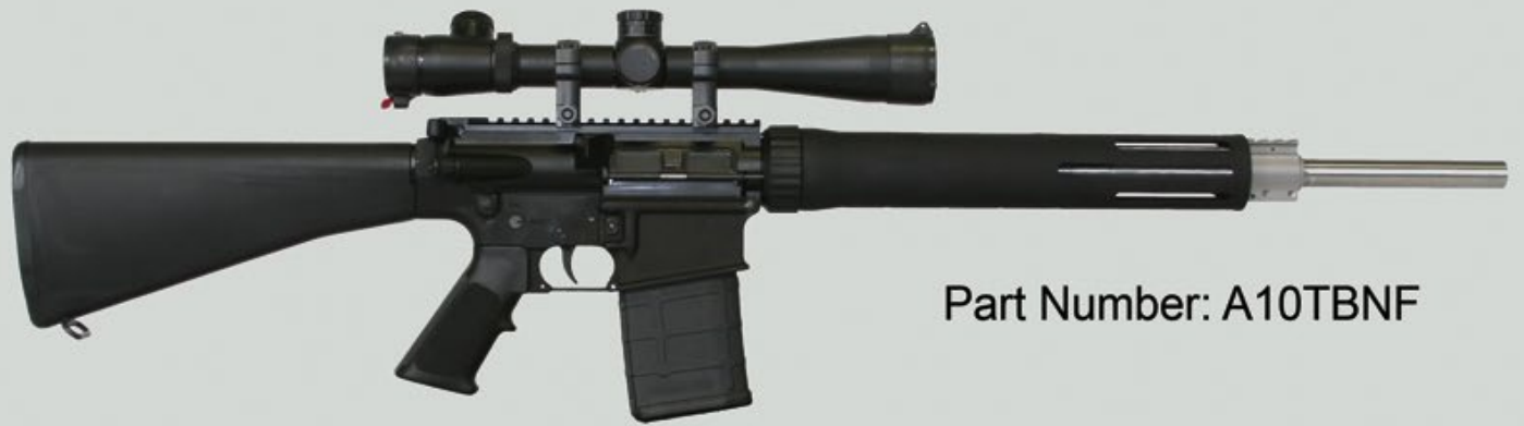
Part Number: A10TBNF