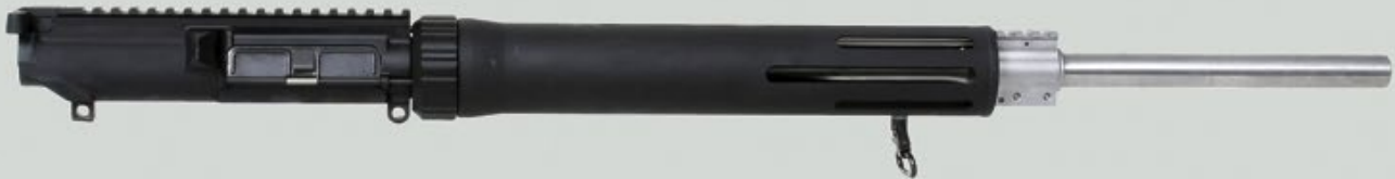
Part Number: AU10TBF